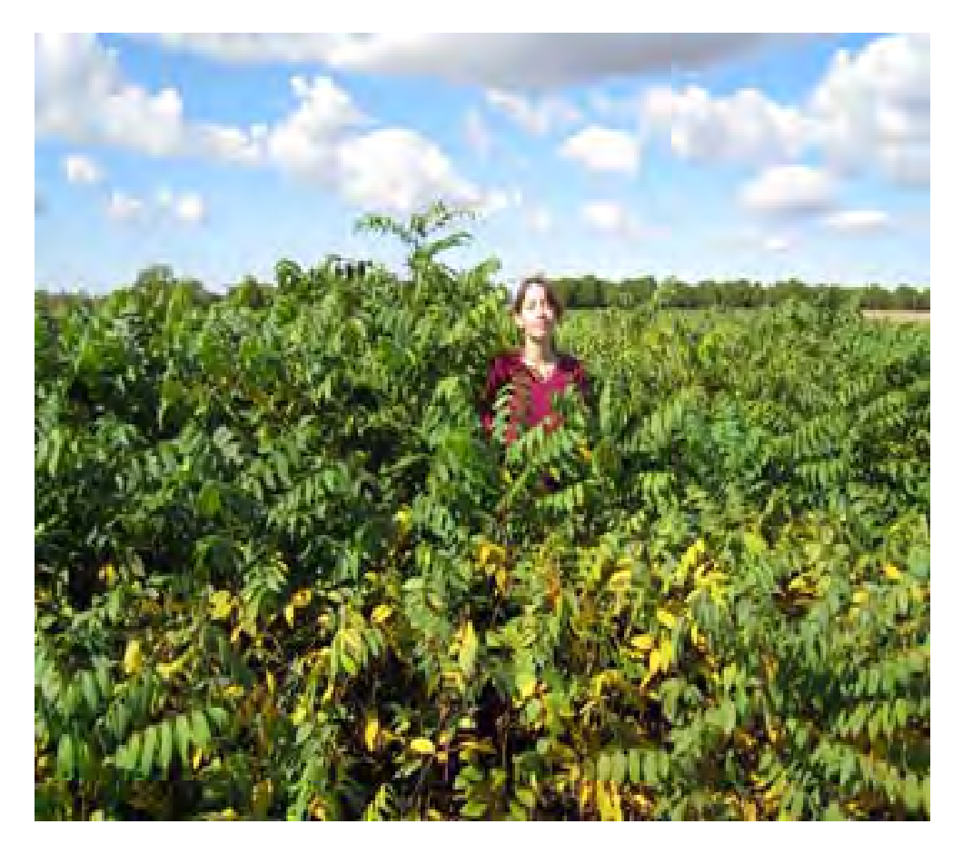
Figure 8. Seedlings can grow quickly with adequate moisture and fertilization. Oriana Rueda Krauss, HTIRC graduate student, stands among some large hybrid butternut seedlings.