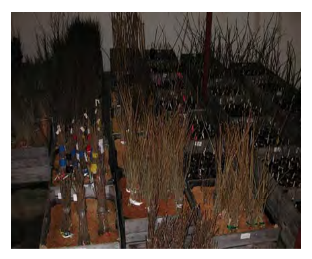
Figure 10. Once lifted from the nursery beds as bare-root seedlings, seedlings are bundled and stored in moist wood chips inside a cooler in preparation for planting at their final destination. Most planting takes place in the spring.