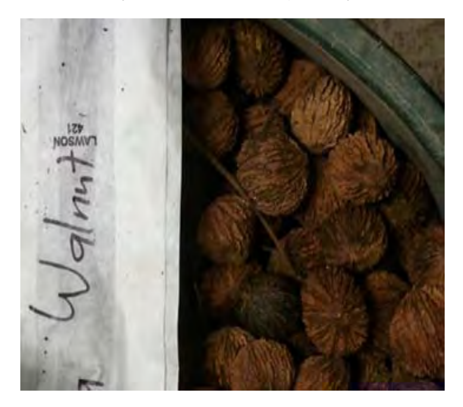
Figure 3. Black walnut seed cleaned and ready for the nursery bed.