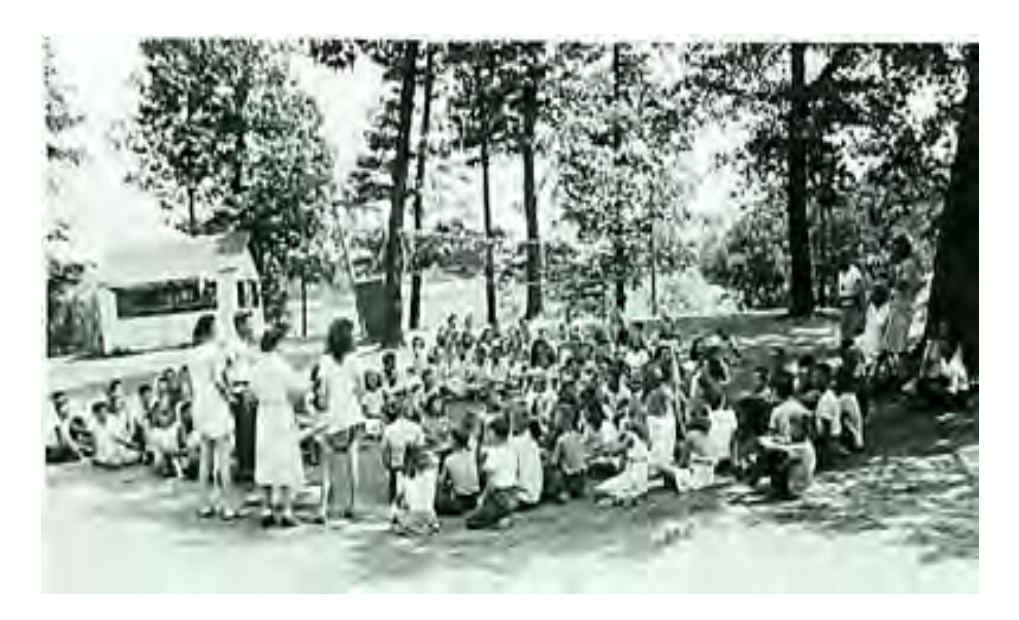
Adams County: 4-H Camp, 1947. Photos: FNR Archives (Accession No. ATP.EXTN.PRI.020)