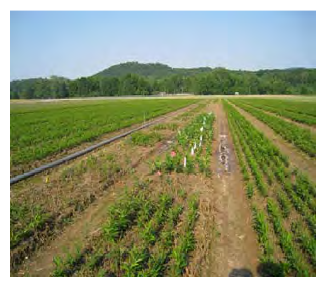
Figure 7. Early in the spring, prior to seedling emergence, the winter wheat is sprayed with an herbicide to kill the wheat, and seedlings emerge through the dead wheat mulch.