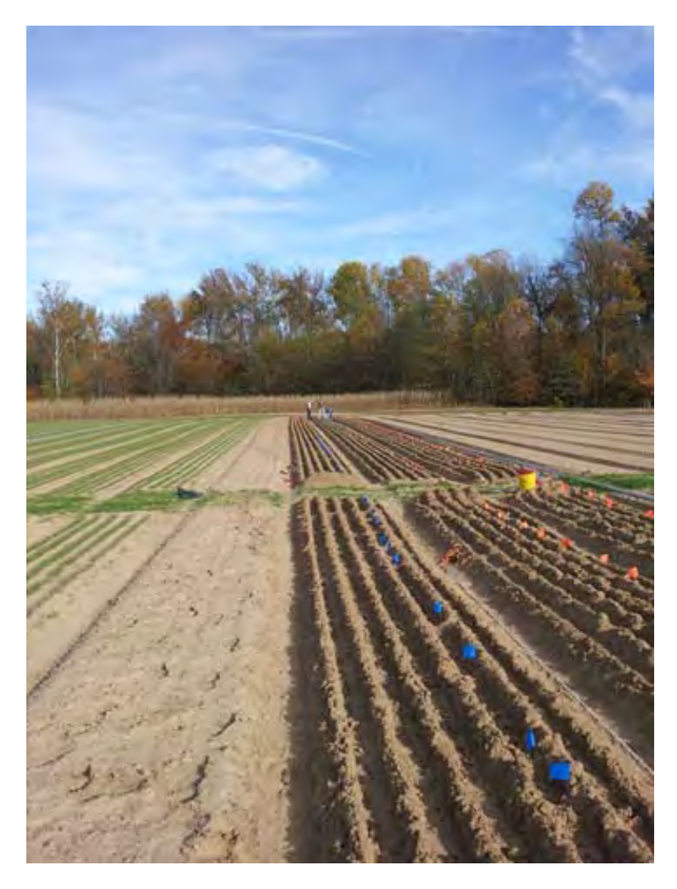
Figure 5. Nursery beds plowed, flagged to separate seed lots, and ready for planting. Look closely in the furrows and you may see the seed ready to be covered.