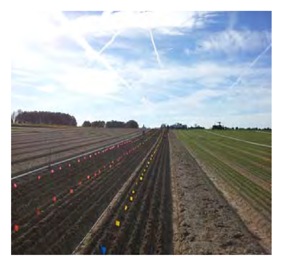
Figure 6. From the left side of the photo we see the progression from a furrowed bed ready for planting, a planted bed covered with soil, and beds with a living mulch of winter wheat growing over the seed. The covered bed and winter wheat beds are seedlings for sale by the nursery and do not need the flagging to indicate individual seed lots.