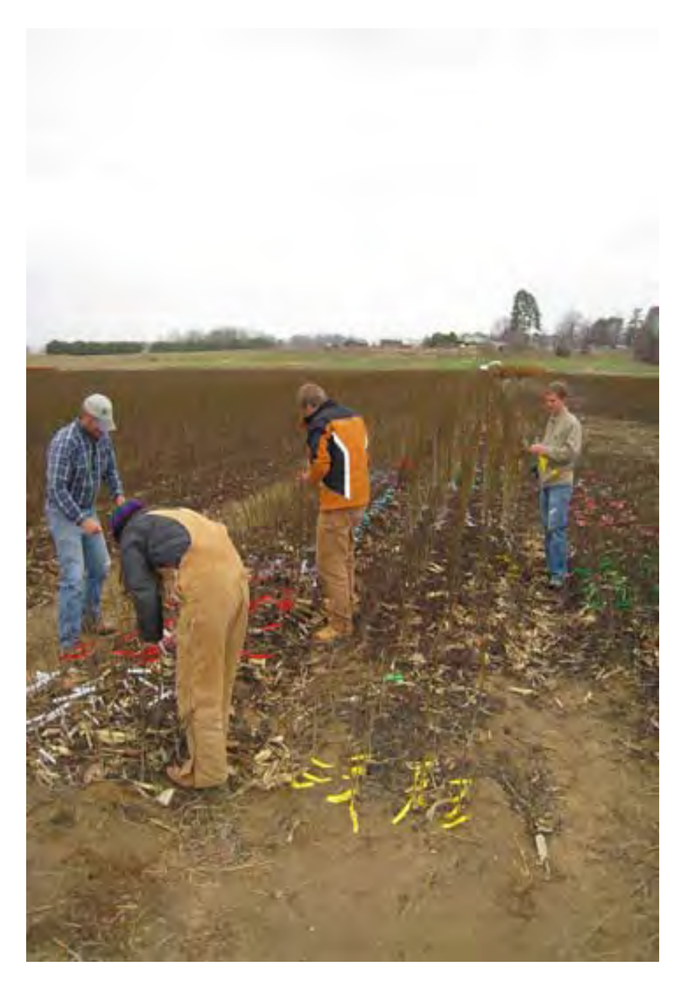
Figure 9. After a growing season in the nursery beds, seedlings are tagged and prepared for lifting and packaging for transport to temporary storage or their planting locations.