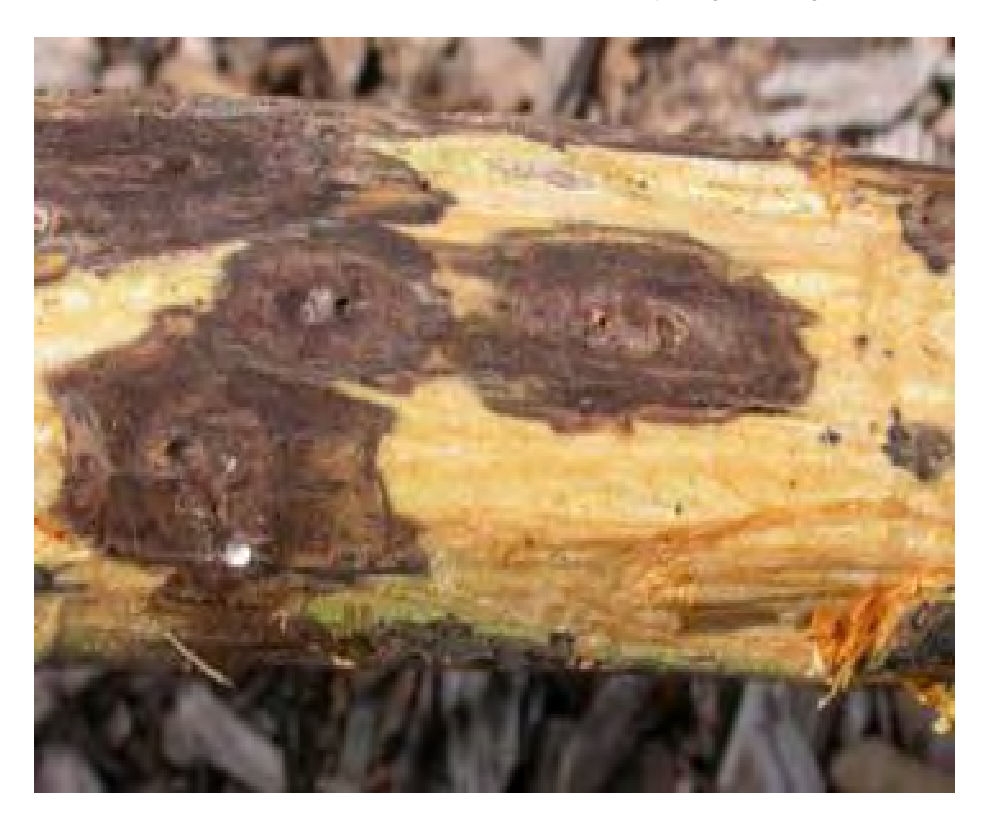
Figure 2. Cankers in the inner bark of a black walnut branch.