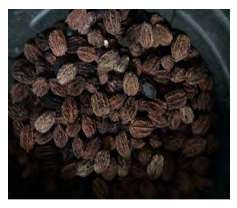
Figure 2. Cleaned butternuts ready for sowing.