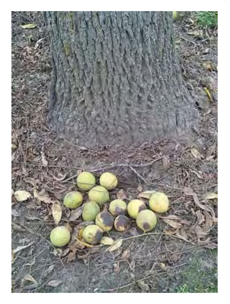
Figure 1. Walnuts from a parent tree in an HTIRC orchard, ready for collection and cleaning. Keeping good records of parentage is essential for effective long term tree breeding programs.

The seedlings produced from these seed will be used for a variety of test and orchard plantings in the Spring of 2015.