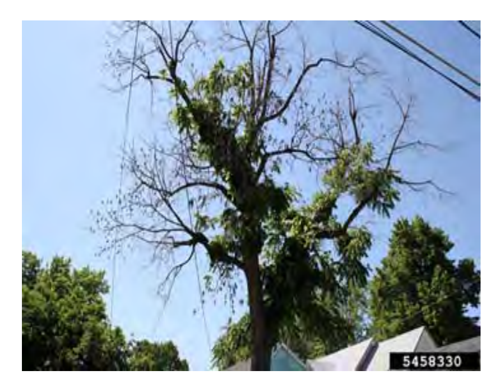
Figure 1. Black walnut tree with thousand cankers disease.